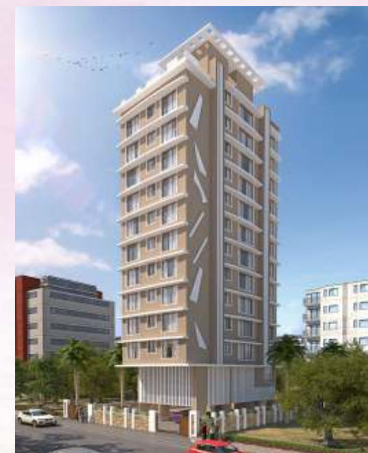
MAHESH APARTMENT CO-OP. HSG. SOCIETY LTD. BHANDUP (EAST), MUMBAI - 400042