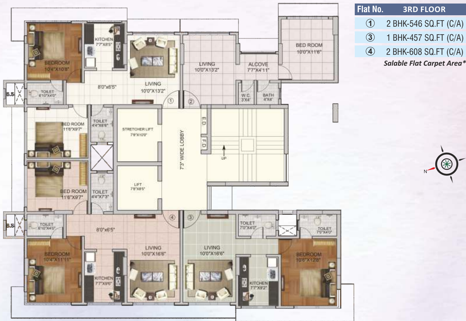
3rd Floor Plan