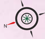
11th Floor Plan

Flat No. 9TH FLOOR ② 1 BHK-406 SQ.FT (C/A) Salable Flat Carpet Area*