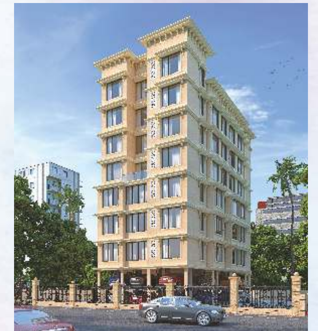
VISHNU BHASKAR CO-OP. HSG. SOCIETY LTD. KANJURMARG (EAST), MUMBAI - 400042