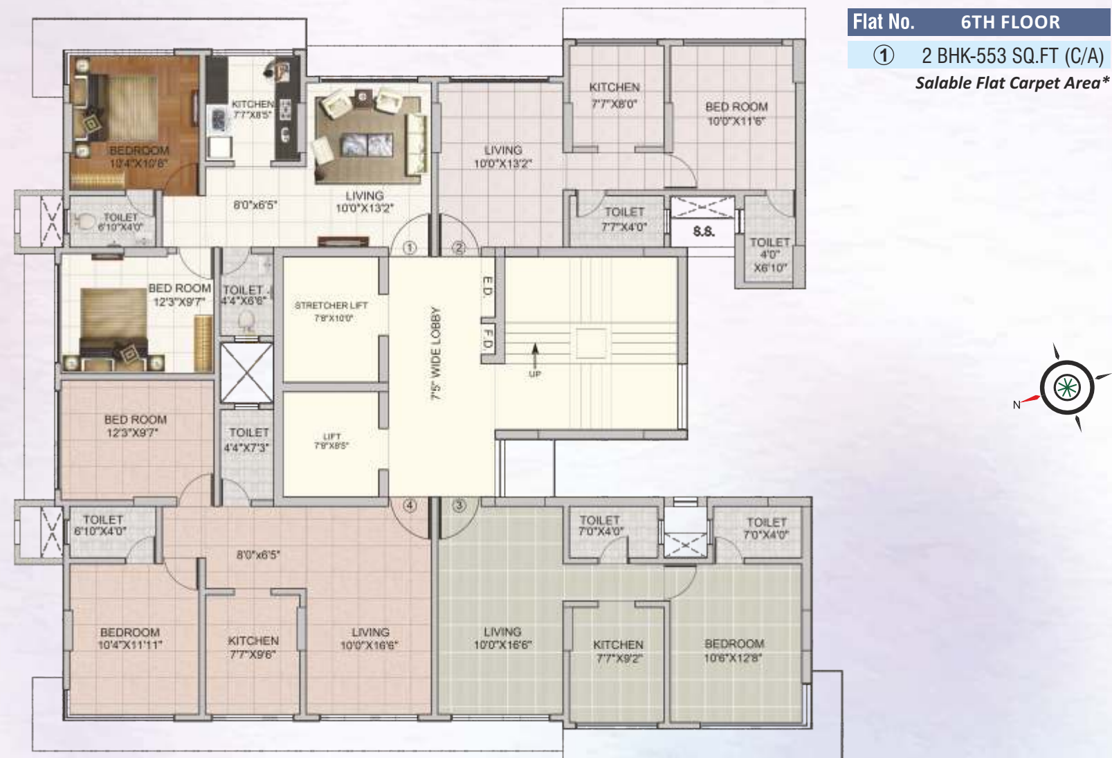
6th Floor Plan