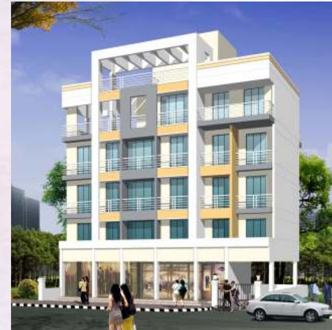
SUDHANSHU PRIDE SECTOR-19, AIROLI, NAVI MUMBI