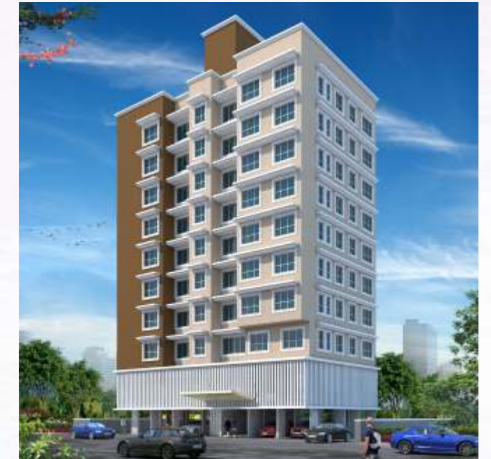
ANURAG CO-OP. HSG. SOCIETY LTD. KANJURMARG (EAST), MUMBAI - 400042