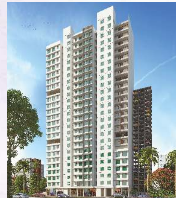
SUDHANSHU IMPERIA BHANDUP (WEST), MUMBAI - 400078