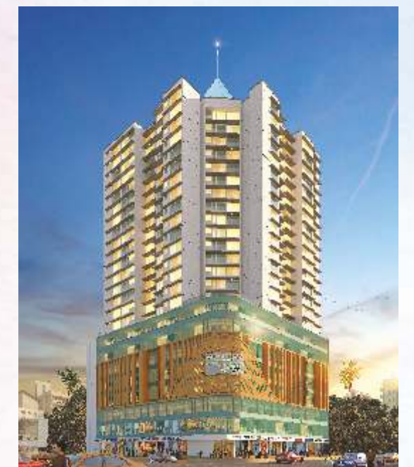
ANIRAJ TOWER BHANDUP (WEST), MUMBAI - 400078