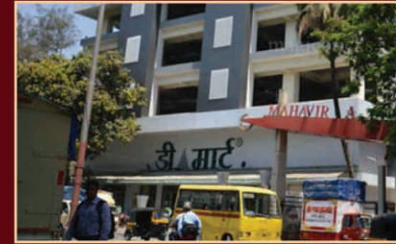
D-MART at Kanjurmarg Station (West)