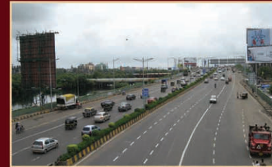
Western Express Highway