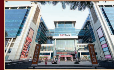
HOME TOWN in Vikroli