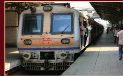
Near by Kanjurmarg & Bhandup Station