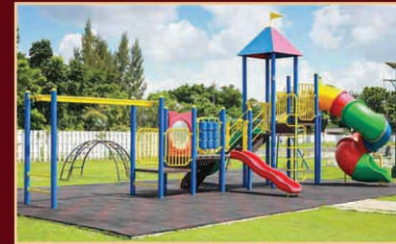
Kids Play Ground in Kanjurmarg